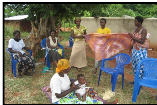
Island women learning tie-dye

Helping island women see their value in their Creator's eyes, and equipping them with valuable skills are among the goals of the Women's Crafts and Economic Development ministry. Income generation for Lingira Island women has been mostly limited to drying and cooking fish or gardening. Assisting the women to discover and expand a source of sustainable income with handcraft skills is a thrust of the project.