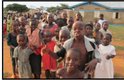
Photos: A southern island sunrise and children of Namiti with the YWAM base in the background.

SHIM moves forward. If you want more information about how you can give and pray for this project, e-mail shim@shimuganda.com .