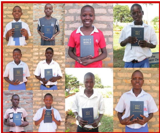
Equipping young minds with the Word of God - A few of the many island secondary students who memorized for and received Bibles this year.

Such a gift is an investment in eternity!